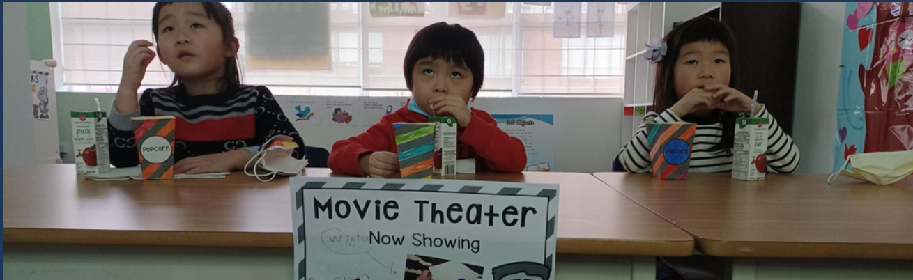
KINDERGARTEN: EXPLORED THE FIVE SENSES IN A FUN, HANDS-ON WAY ("AT THE MOVIE THEATRE" ROLE PLAY, POPCORN VOLUME MATH ACTIVITY AND STORY SEQUENCING IN ELA). WATCHED A FEW SHORT CHILDREN FILMS FROM THE NATIONAL FILM BOARD OF CANADA ARCHIVE.