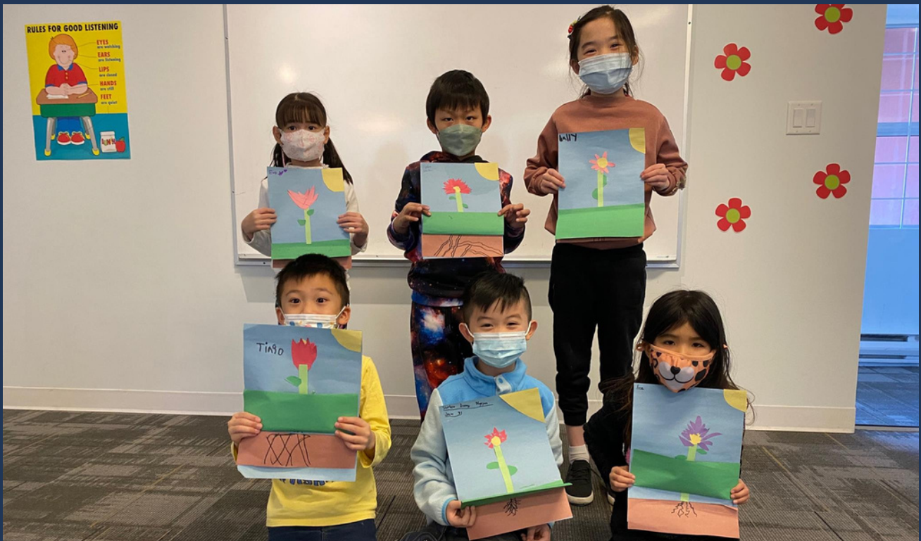
GRADE 1-2: LEARNING ABOUT PLANTS IN A SCIENCE/ART ACTIVITY