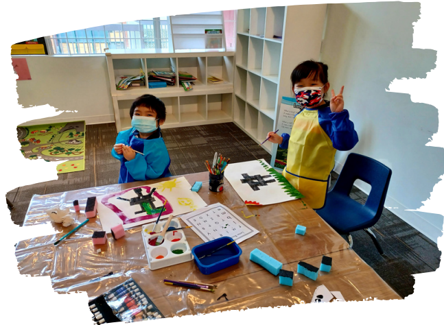
INUKSHUK: ART FROM NUNAVUT